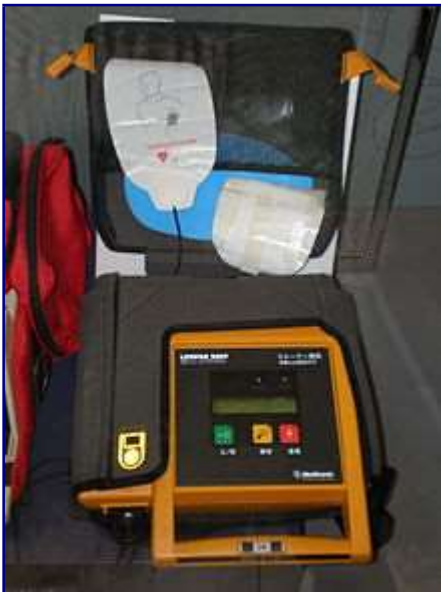
Defibrillator training kit

Most cases are fatal. Automated external defibrillators have helped increase the survival rate to 35%.[1] Defibrillation must be started as soon as possible (within 3 minutes) for maximal benefit. Commotio cordis is the leading cause of fatalities in youth baseball in the US, with two to three deaths per year.[9]