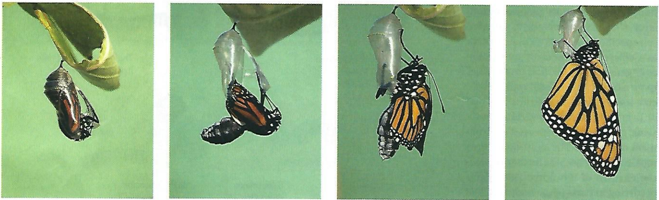
INSPIRED BY NATURE: The hormone ecdysone regulates the process of molting, which transforms many insects, such as this butterfly, into their adult form. Now a biotech firm has reworked ecdysone into a much needed safety switch for gene therapy.

The researchers also found hints that the therapy could be helpful. In one of the studies, they injected the gene-plus-switch