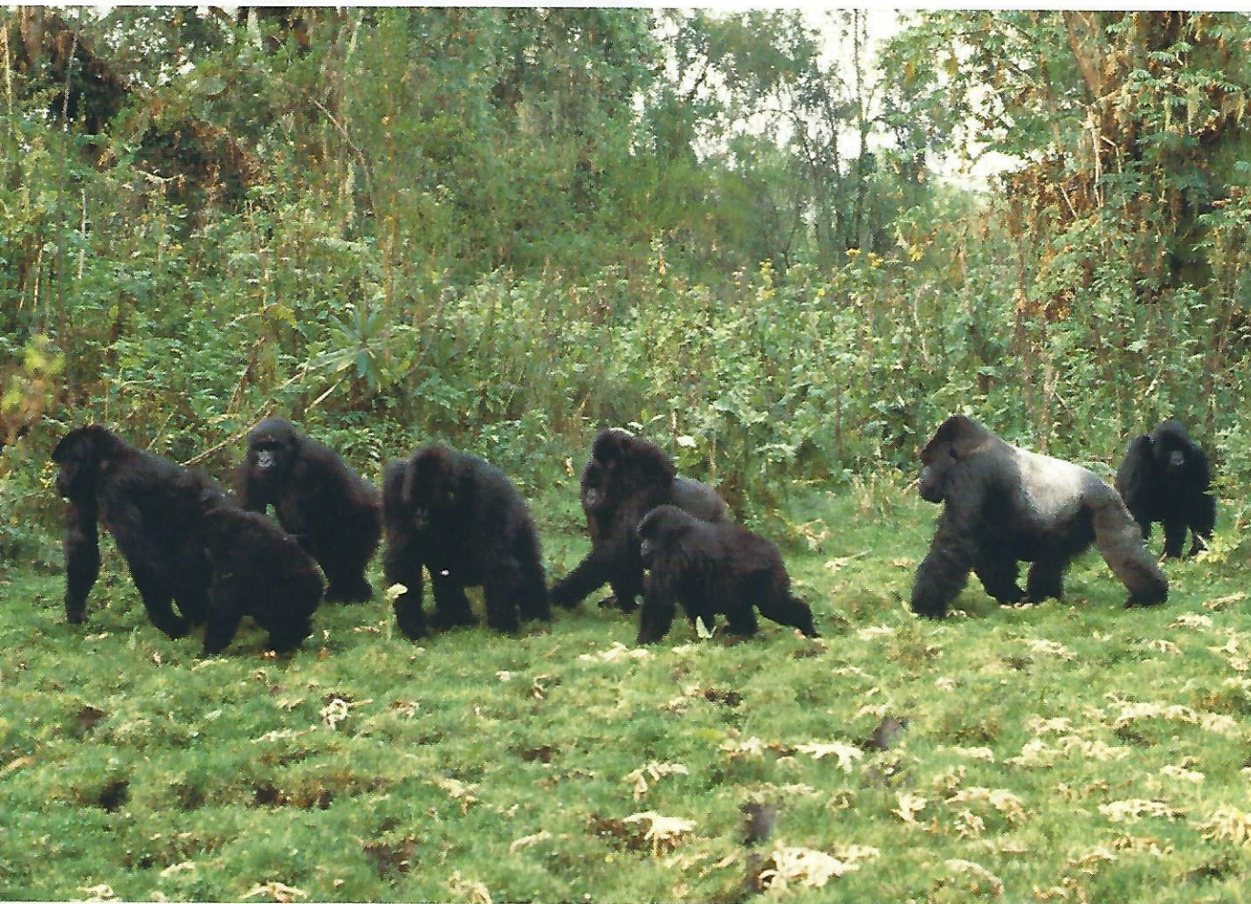
SILVERBACK male mountain gorilla ( at right ) leads his troop in Rwanda. Gorillas, which are polygamous, live in small groups consisting of one dominant male, multiple female mates and their offspring.

For evidence, Lovejoy points to Ar. ramidus 's teeth. Compared with living and fossil apes, Ar. ramidus shows a stark reduction in the differences between male and female canine-tooth size. Evolution has honed the daggerlike canines of many male primates into formidable weapons used to fight for access to mates. Not so for early hominins. Picture the canines in a male gorilla's gaping jaws; now peer inside your own mouth. Humans of both sexes have small, stubby canines—an unthreatening trait unique to hominins, including the earliest Ardipithecus specimens.