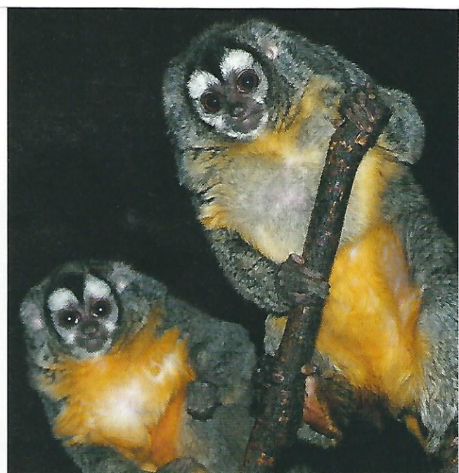
AZARA'S OWL MONKEYS of South America are fully monogamous, with the father handling much of the child care.